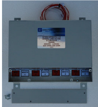
GF58270-XX-4 SIGNAL LINE FILTER 4 PAIR - 8 WIRE